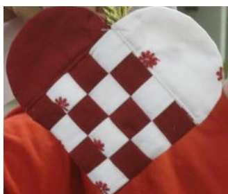
Don't know who made the heart, but it might give you an idea.